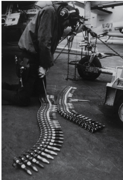
Loading ammunition on the USS Enterprise aircraft carrier, South China Sea, December 1966-January 1967, original silver halide print