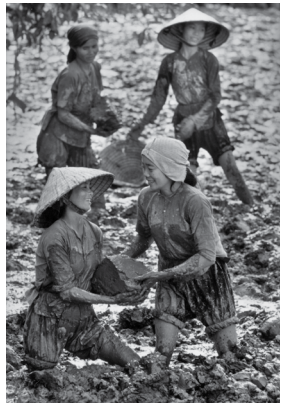
Women removing boulders by hand from a canal, North Vietnam, 1969