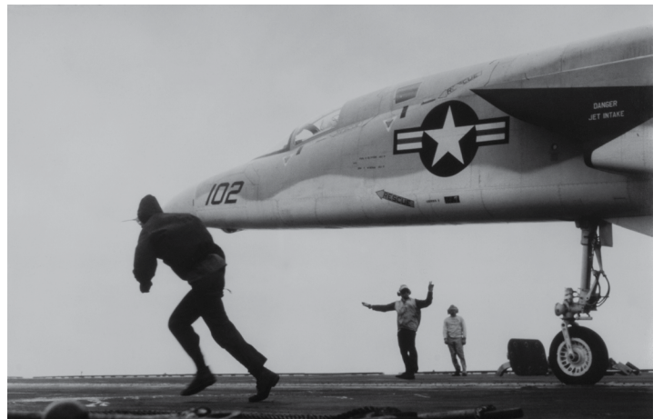
Skyhawk aircraft on the deck of the USS Enterprise aircraft carrier, South China Sea, December 1966-January 1967, original silver halide print