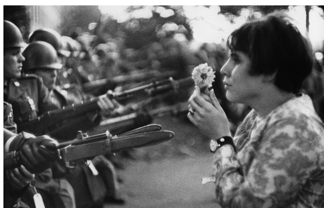
Marc Riboud, Young Girl Holding a Flower, anti-Vietnam war protest, Washington, USA, 1967

To mark the 50th anniversary of the end of the Vietnam war, Friends of Marc Riboud and Guimet (which conserves the great French photojournalist's collections) have come together to present the photograph and document archive that retrace the work of Marc Riboud in Vietnam between 1966 and 1976.