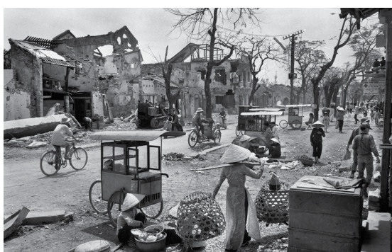
Huế, main street of the citadel, South Vietnam, 1968