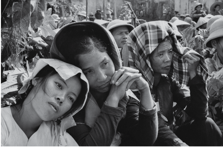
Announcement of the end of Operation Rolling Thunder in Phat Diem, North Vietnam, 1968